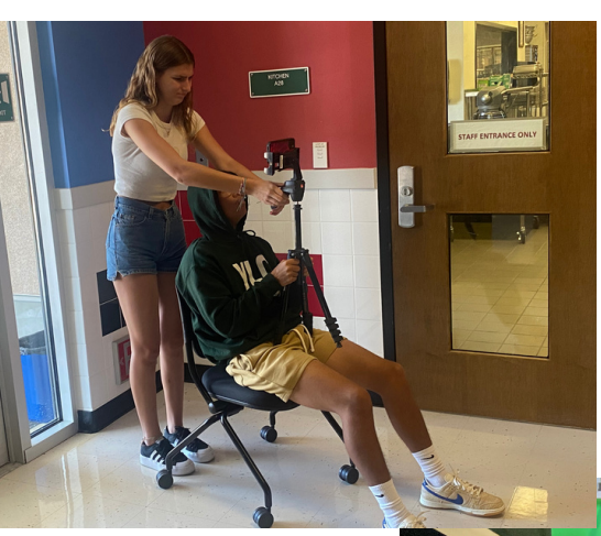
Twenty high school kids created story boards, learned equipment safety, directed, acted, edited, and watched each others short films.