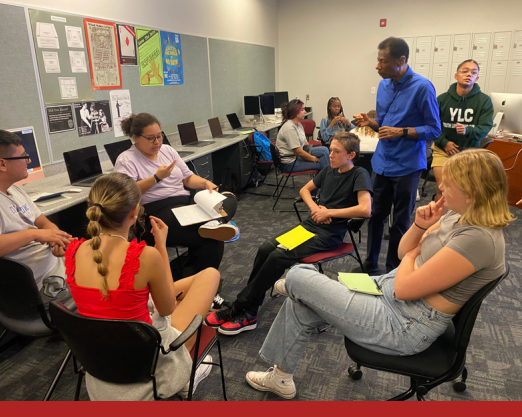
The camp them was "What makes you proud?" The workshops were taught by CJ Jones and Toj Mora.